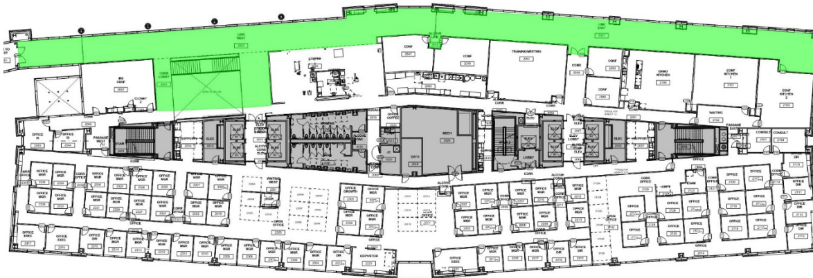
2 nd Floor Plan