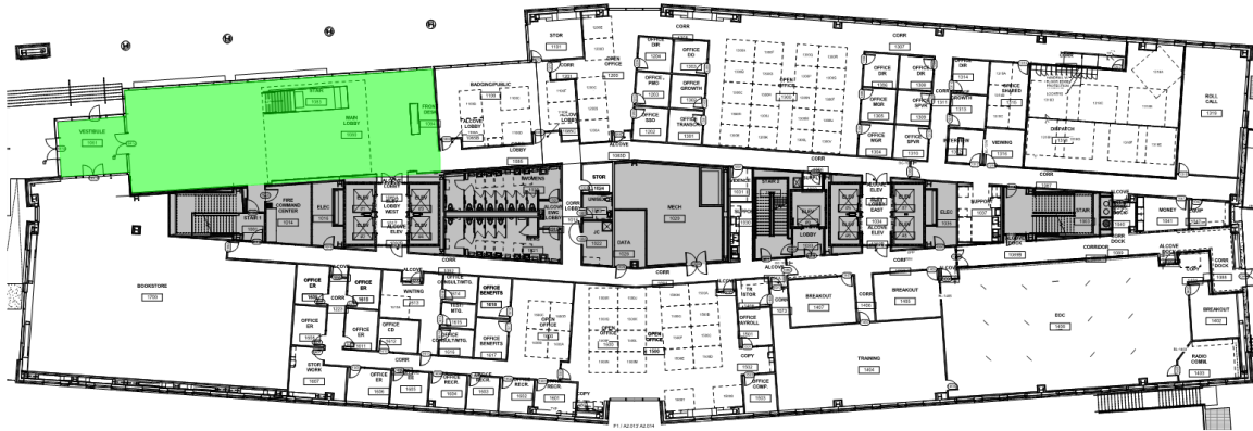
1 st Floor Plan