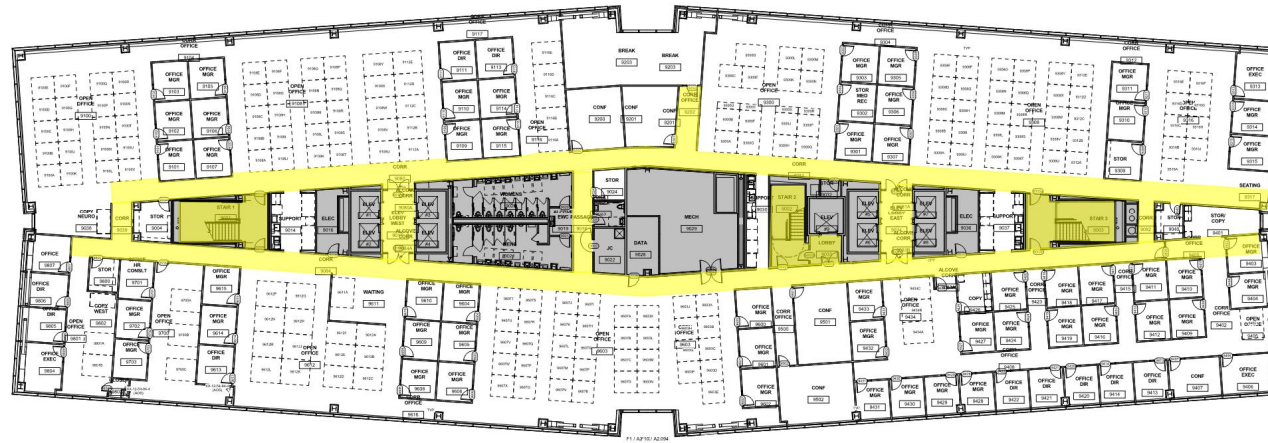
9 th Floor Plan (11 th & 12 th Floor Plans are similar)