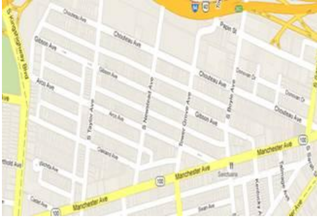
Forest Park Southeast Neighborhood