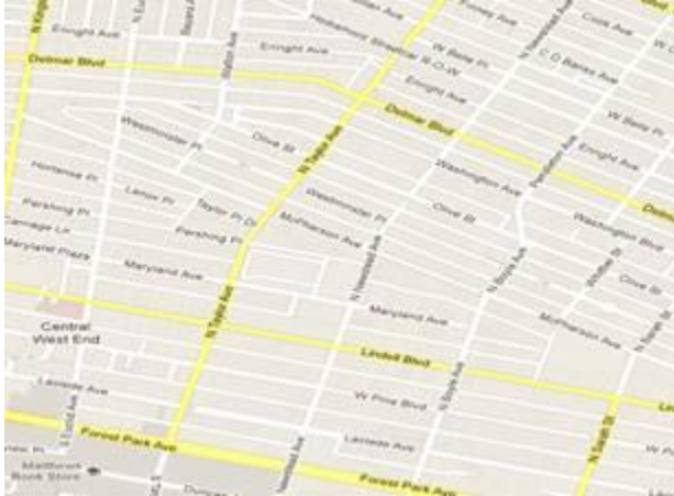
Central West End Neighborhood