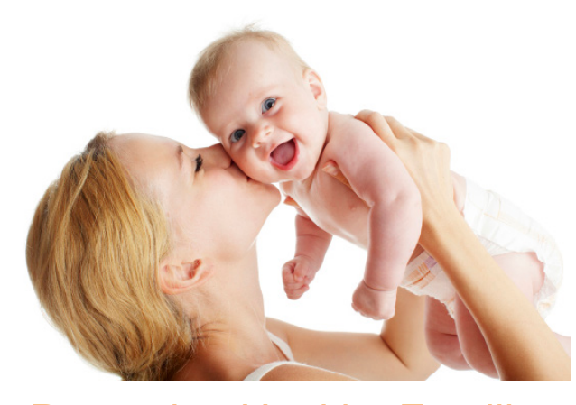
Promoting Healthy Families